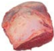
Beef Sirlion Rump Weight/Quantity 4kg Approx Price Unit: KILO Price €14.25/KG CODE: 60016