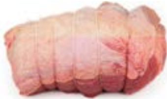
Beef Rib Boneless/ Tied Weight/Quantity 4kg Approx Price Unit: KILO Price €10.75/KG CODE: 60013