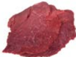
Beef Braising Steaks Weight/Quantity 6oz Approx Price Unit: KILO Price €12.30/KG CODE: 60022