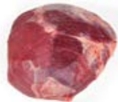
Beef Topside Weight/Quantity 8-10kg Approx Price Unit: KILO Price €8.50/KG CODE: 60015