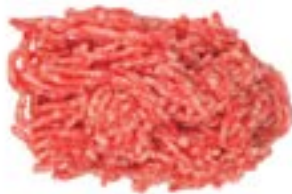
Beef Mince 95v1 Weight/Quantity 2.5kg Price Unit: UNIT Price €15.50 CODE: 60019