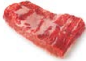
Beef Brisket Weight/Quantity 6kg Approx Price Unit: KILO Price €8.25/KG CODE: 600100