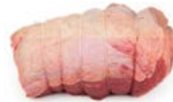
Beef Top Rib (Rolled/Tied) Weight/Quantity 2-3kg Approx Price Unit: KILO Price €9.50/KG CODE: 60017