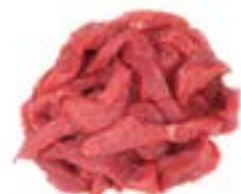
Beef Stir Fry Extra Lean Weight/Quantity 2.5kg Price Unit: UNIT Price €23.50 CODE: 600211