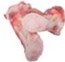
Beef Marrow Bones Weight/Quantity 13-15kg Approx Price Unit: KILO Price €1.50/KG CODE: 60024