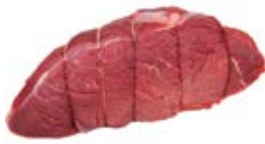
Beef Topside (Rolled/Tied) Weight/Quantity 8kg Approx Price Unit: KILO Price €8.50/KG CODE: 60014