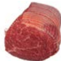
Beef Corned Silverside Weight/Quantity 3kg Approx Price Unit: KILO Price €10.20/KG CODE: 60018