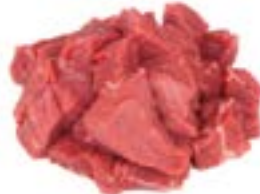
Beef Diced Weight/Quantity 2.5kg Price Unit: UNIT Price €20.00 CODE: 60020