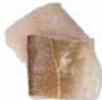
Hake Portions 200g Weight/Quantity 10pce Price Unit: CASE Price €26.00 CODE: 75023