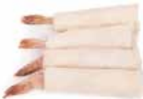
King Prawn In Filo Weight/Quantity 500g Price Unit: UNIT Price €6.50 CODE:76046