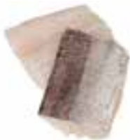
Hake Fillets Skin On Weight/Quantity 5kg Traypack Price Unit: KILO Price €11.35/KG CODE: 75019