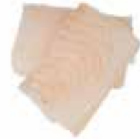
Cod Fillets Portioned Weight/Quantity 170g Price Unit: UNIT Price €2.95 CODE: 75015