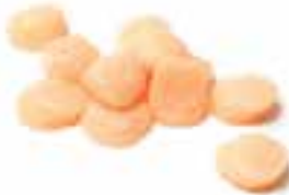
King Scallop Roe Off Weight/Quantity 1kg Price Unit: UNIT Price €24.00 CODE: 76044