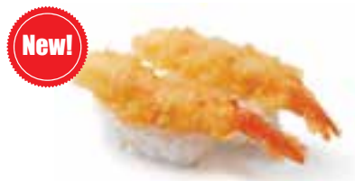
Tempura Prefried Prawn Weight/Quantity 500g Price Unit: UNIT Price €7.85 CODE: 11589