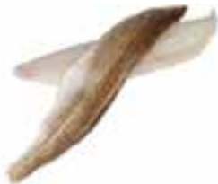
Cod Fillets Skin On Weight/Quantity 5kg Approx Price Unit: KILO Price €14.95/KG CODE: 75016