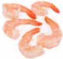
Prawns Cooked&Peeled 31/40 Weight/Quantity 450g Price Unit: UNIT Price €4.75 CODE: 76040