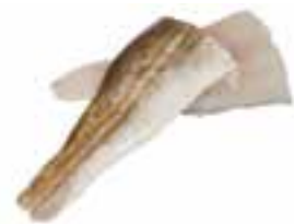
Cod Tail Portions S&P Weight/Quantity 10x200g Price Unit: KILO Price €14.75/KG CODE: 75018