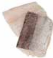
Hake Fillet Skin On Weight/Quantity 2kg Traypack Price Unit: KILO Price €12.25/KG CODE: 75020