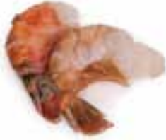
Prawn 6/8 Raw, Shell On Weight/Quantity 905g Price Unit: UNIT Price €15.95 CODE: 76037