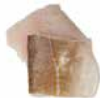
Hake Portions 160g Weight/Quantity 10pce Price Unit: CASE Price €22.00 CODE: 75022