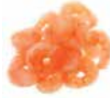
Cold Water Prawn 150/250 Weight/Quantity 2kg Price Unit: UNIT Price €19.50 CODE: 76041