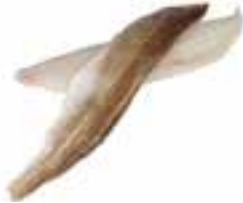
Cod Fillets Skin On 330/400g Weight/Quantity 2kg Traypack Price Unit: KILO Price €14.95/KG CODE: 75013