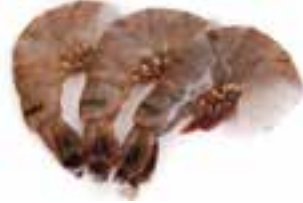
Prawns 16/20 Raw, Peeled Weight/Quantity 1kg Price Unit: UNIT Price €13.00 CODE: 76038