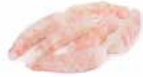
Mozambique Prawns 70/90 Weight/Quantity 1kg Price Unit: UNIT Price €19.95 CODE: 76039