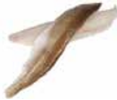
Cod Fillets S&P 330/400G Weight/Quantity 2kg Traypack Price Unit: KILO Price €15.75/KG CODE: 75014