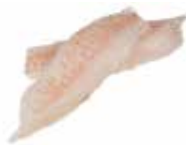
Cod Loin Fillets Weight/Quantity 2kg Approx Price Unit: KILO Price €24.50/KG CODE: 75017