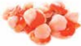
King Scallop Roe On 8/12 Weight/Quantity 1kg Price Unit: UNIT Price €19.00 CODE: 76043