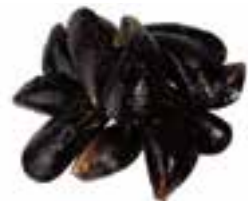
Whole Shell Mussels Weight/Quantity 1kg Price Unit: KILO Price €3.95/KG CODE:76048