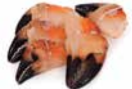
Crab Claws Weight/Quantity 454g Price Unit: UNIT Price €9.75 CODE: 76045