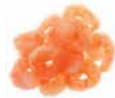
Prawns Cooked&Peeled 90/125 Weight/Quantity 2.5kg Price Unit: UNIT Price €23.50 CODE: 76042