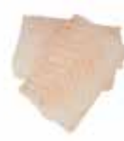
White Fish Portion 2oz Weight/Quantity 2kg Traypack Price Unit: KILO Price €14.50/KG CODE: 75024