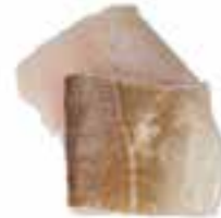
Hake Portions 140g Weight/Quantity 10 pce Price Unit: CASE Price €19.00 CODE: 75021