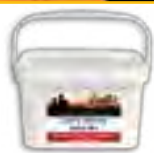
Leah's Mild Curry Mix 5kg