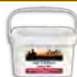
Leah's Taco Seasoning 5kg