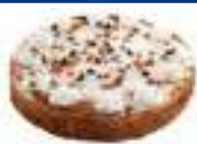
Patisserie Royale Bailey's Cheesecake 12Ptn Code:CHBA Was €15.00 NOW €12.50