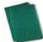
Green Scouring Pads 9x6 50pce Code: 12230 Was €12.00 NOW €10.50