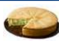
Patisserie Royale Deep Apple Pie 12Ptn Code:AT Was €10.56 NOW €9.00