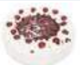
Coppenrath Black Forest Gateau 16Ptn Code:84043 Was €8.50 NOW €7.50