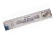
Catering Tin Foil 90M Code: 101991 Was €6.50 NOW €5.75