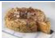
Patisserie Royale Cappuccino Gateau 12Ptn Code:CG Was €17.70 NOW €15.00