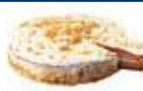
Patisserie Royale Carrot Cake 12Ptn Code:CC Was €16.00 NOW €14.00