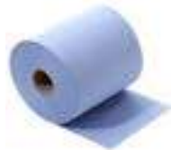
Blue Roll 6x170Mtr Code: 1690 Was €10.00 NOW €7.50