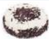
Coppenrath Choc Cream Tarte 16Ptn Code:84044 Was €8.50 NOW €7.50