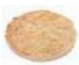
Coppenrath Apple Crumble 12Ptn Code:84017 Was €7.50 NOW €6.50