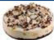
Patisserie Royale Hazelnut Profiterole Gateau 12Ptn Code:PFG Was €20.00 NOW €17.50