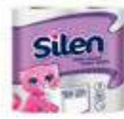
Toilet Paper 8pack x6 Code: 20048 Was €10.50 NOW €8.95