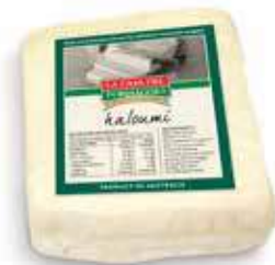
haloumi Weight/Quantity: 225g Case: 225g X 10pce Code: 20037