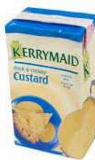
Kerrymaid RTs Custard

Weight/Quantity: 500g Case: 500g X 6pce Code: 18502