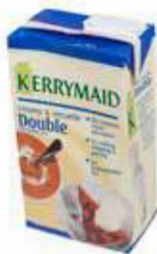
Kerrymaid Double Whipping Cream

Weight/Quantity: 1ltr Case: 1ltr X 12pce Code: 50002