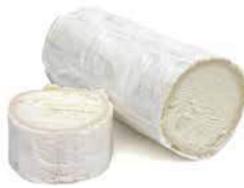
el Pastor Goats Cheese Log Weight/Quantity: 1kg Case: 1kg X 2pce Code: 71250