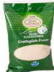
Gran Moravia Grated Weight/Quantity: 1kg Case: 1kg X 10pce Code: 20800