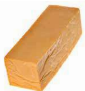
Red Cheddar Block Weight/Quantity: 2.5kg Case: 2.5kg X 8pce Code: 77025