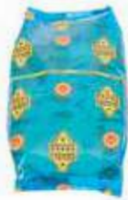
Grana Padano shavings Weight/Quantity: 1kg Case: 1kg X 10pce Code: 12590