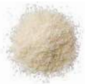
Grana Padano Grated Weight/Quantity: 1kg Case: 1kg X 10pce Code: 33374