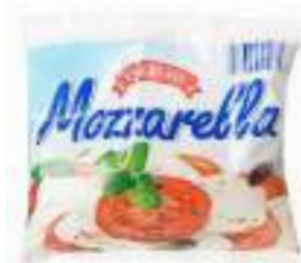
Fresh Mozzarella Velgrande Weight/Quantity: 125g X 20pce Case: 125g X 20pce Code: 210046