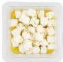
Kourellas Feta Cheese In Brine Weight/Quantity: 2kg Case: 2kg X 2pce Code: 12650