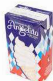
Angelito Ice Cream Mix

Weight/Quantity: 1ltr Case: 1ltr X 12pce Code: 199