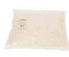
Grated Mozzarella Weight/Quantity: 2kg Case: 2kg X 5pce Code: 14789