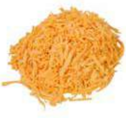
Grated Red Cheddar Weight/Quantity: 2kg Case: 2kg X 5pce Code: 96375