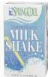
springcool Milkshake Concentrate

Weight/Quantity: 1ltr Case: 1ltr X 12pce Code: 50002