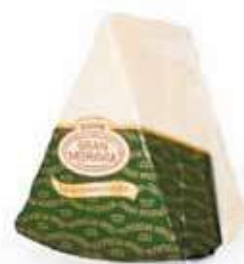
Gran Moravia Wedge Weight/Quantity: 1kg Case: 1kg X 10pce Code: 210039