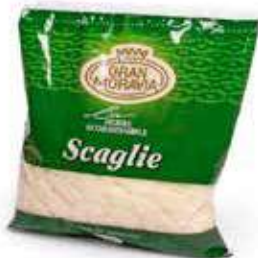
shaved Gran Moravia Weight/Quantity: 500g Case: 500g X 10pce Code: 210040