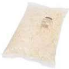
Grated White Cheddar Weight/Quantity: 2kg Case: 2kg X 5pce Code: 54321