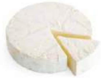
Brie Wheel Approx Weight: 3kg Case: 3kg Approx Code: 1005