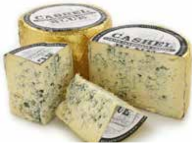
Cashel Blue Approx Weight: 1.5kg Case: 1.5kg X 2pce Code: 12570