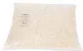
Diced Mozzarella Weight/Quantity: 2kg Case: 2kg X 5pce Code: 77033