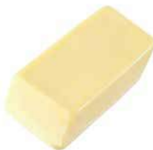
White Cheddar Block Weight/Quantity: 2.5kg Case: 2.5kg Code: 77026