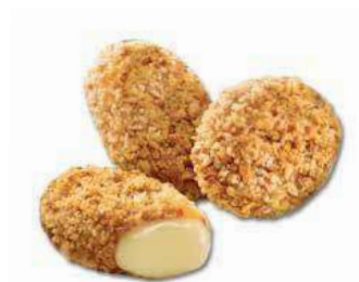
Breaded Brie Wedges Weight/Quantity: 37g Case: 37g X 24pce Code: 1379