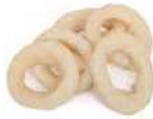
McCain Beer Battered Onion Rings Weight/Quantity: 1kg X 6pce Case: 6kg Code: 306501