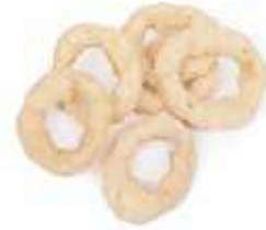
Diggers Preformed Onion Rings Weight/Quantity: 1kg X 6pce Case: 6kg Code: 12930