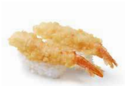
Pacific West Tempura Prefried Prawn Weight/Quantity: 500g Case: 500g X 10pce Code: 690611