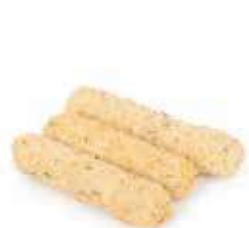
McCain Mozzarella Cheese Sticks Weight/Quantity : 1kg Case: 1kg X 6pce Code: 5927