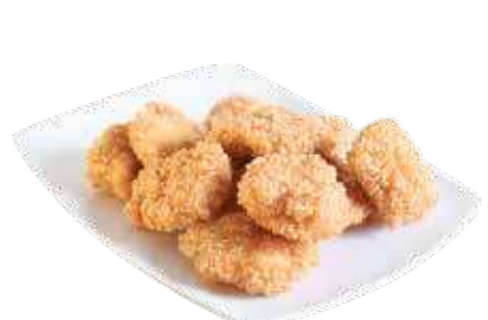
Kepak Firey Mozzarella Balls Weight/Quantity: 1kg Case: 1kg X 4pce Code: 968600