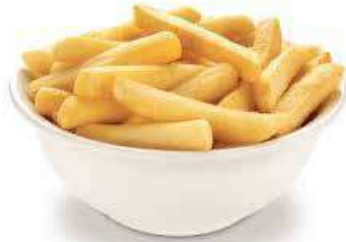
McCain Freeze Chill 11mm Chips Weight/Quantity: 2.5g X 5pce Case: 12.5kg Code: 95002