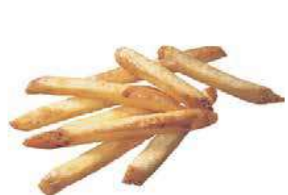
McCain SkinOn Country Style Fries Weight/Quantity: 2.5kg X 5pce Case: 12.5kg Code: 1999