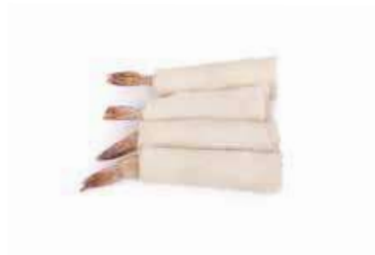
King Prawns In Filo Weight/Quantity: 500g Case: 500g X 10pce Code: 76046