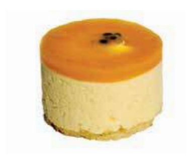
Ind Mango & Passionfruit Mousse Weight/Quantity: 75g Case: 75g X 28pce Code: 840006