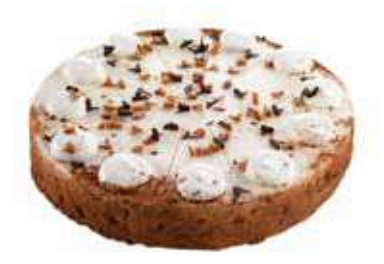
Baileys Cheesecake Weight/Quantity: 1500g Case: 125g X 12ptn Code: 11574