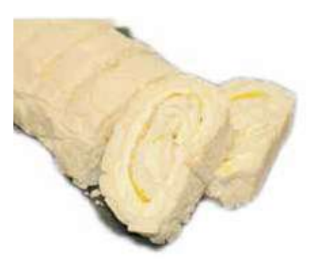
Lemon Roulade Weight/Quantity: 1000g Case: 1000g Code: 11588