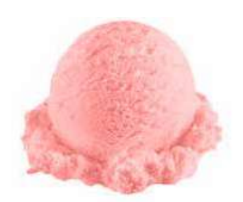
Soft Scoop Strawberry Ice Cream

Weight/Quantity: 4ltr Case: 4ltr X 4pce Code: 010605