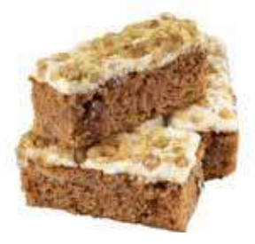
Carrot Cake Traybake Weight/Quantity: 3280g Case: 74g X 44ptn Code: 11557