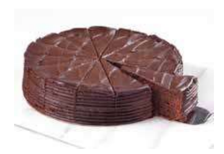
Chocolate Fudge Gateaux Weight/Quantity: 1400g Case: 100g X 14ptn Code: 11572