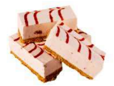
Strawberry Cheesecake Traybake Weight/Quantity: 3290g Case: 75g X 44ptn Code: 11597