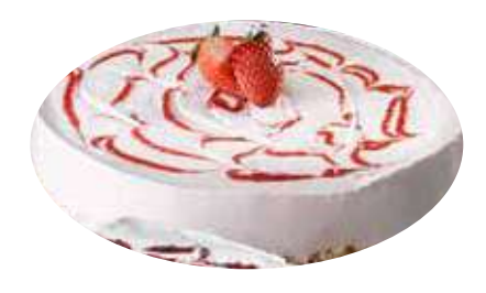
Strawberry Cheesecake Weight/Quantity: 1570g Case: 130g X 12ptn 11576 Code: