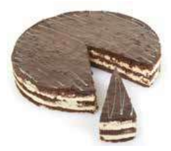
Baileys & Chocolate Cake Weight/Quantity: 1360g Case: 1360g Code: 840003