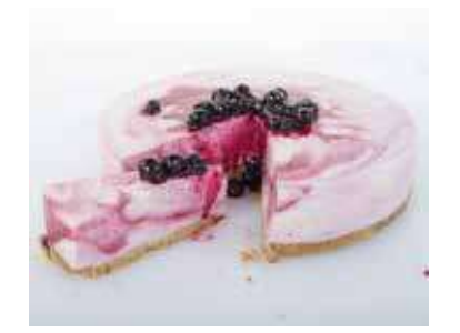
Wild Berry Cheesecake Round Weight/Quantity: 1400g Case: 1400g Code: 260073