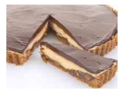
Peanut Butter, Caramel & Choc Tart Weight/Quantity: 1450g Case: 1450g Code: 260165