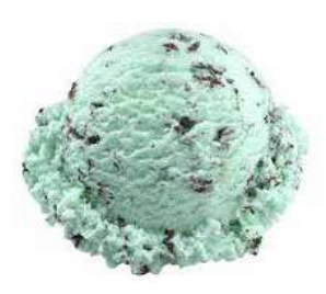
Soft Scoop Mint Choc Ice Cream

Weight/Quantity: 4ltr Case: 4ltr X 4pce 04003 Code: