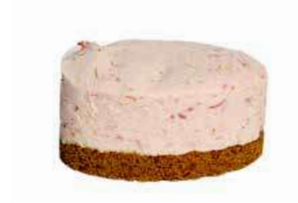
Ind Strawberry Rhubarb Cheesecake Weight/Quantity: 75g Case: 75g X 28pce