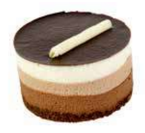
Ind Triple Chocolate Mousse Weight/Quantity: 100g Case: 100g X 28pce Code: 840004