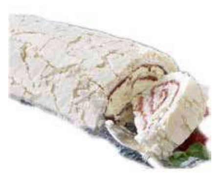
Raspberry Roulade Weight/Quantity: 1000g Case: 1000g Code: 11590