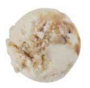
Soft Scoop Honeycomb Ice Cream

Weight/Quantity: 4ltr Case: 4ltr X 4pce Code: 010605