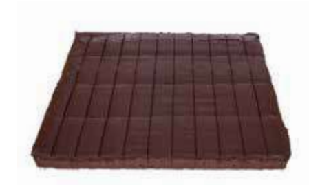
Chocolate Fudge Traybake Weight/Quantity: 44ptn Case: 44ptn Code: 840701