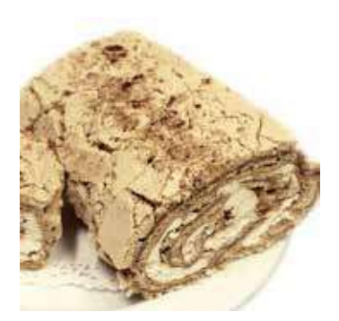
Toffee & Pecan Roulade Weight/Quantity: 1000g Case: 1000g Code: 11591