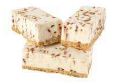
Baileys Cheesecake Traybake Weight/Quantity: 3400g Case: 77g X 44ptn Code: 11595