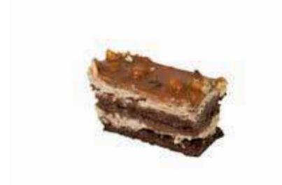
Chocolate & Peanutbutter Stack Weight/Quantity: 8ptn Case: 8ptn X 1pce Code: 1877