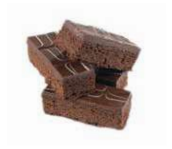
Chocolate Brownie Traybake Weight/Quantity: 3660g Case: 83g X 44ptn Code: 11558