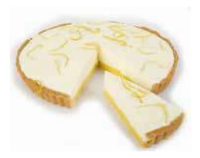
Lemon Curd & Mousse Tart Weight/Quantity: 1500g 1500g Case: 840011 Code: