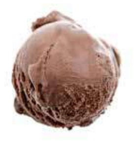
Soft Scoop Chocolate Ice Cream

Weight/Quantity: 4ltr Case: 4ltr X 4pce Code: 011105