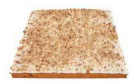
Carrot Cake Traybake Weight/Quantity 44ptn 44ptn Case: Code: 11169