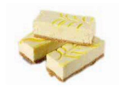
Lemon Cheesecake Traybake Weight/Quantity: 3420g Case: 78g X 44ptn Code: 11596