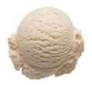
Dairy Indulgence Salted Carmel Ice Cream Weight/Quantity: 4.7ltr 4.7ltr X 1pce Case: Code: 070101