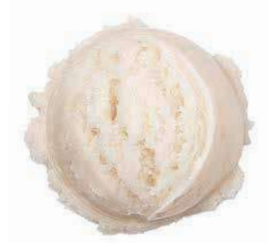
Soft Scoop Vanilla Ice Cream

Weight/Quantity: 4ltr Case: 4ltr X 4pce Code: 011105