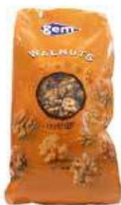
Gem Walnuts Weight/Quantity: 1kg Case: 1kg X 10pce Code: 224