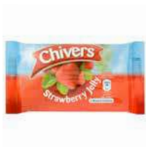
Chivers Strawberry Jelly Weight/Quantity: 135g Case: 135 X 36pce Code: 200045