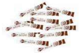
Gem Brown Sugar Sticks Weight/Quantity : 4g Case: 4g X 600pce Code: 74582