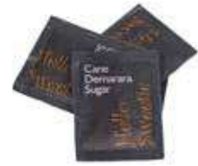
Brown Sugar Sachet Weight/Quantity: 2.5g Case: 2.5g X 1000pce Code: 71670