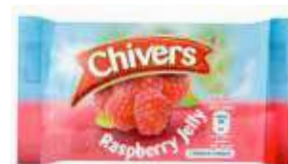
Chivers Raspberry Jelly Weight/Quantity: 135g Case: 135g X 36pce Code: 200047