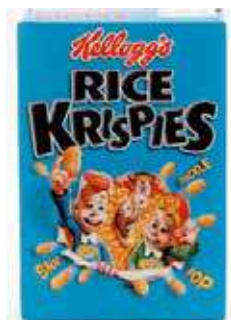
Kellogg's Rice Krispies Weight/Quantity: 510g Case: 510g X 12pce Code: 58034