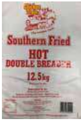
Hot Double Breeder Weight/Quantity: 12.5kg Case: 12.5kg Code: 852021