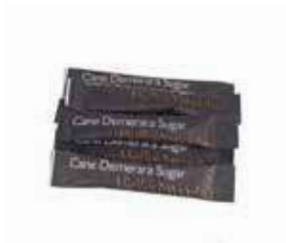
Brown Sugar Sticks Weight/Quantity: 2.5g Case: 2.5g X 1000pce Code: 71743