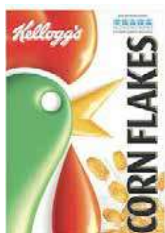
Kellogg's Cornflakes Weight/Quantity: 790g Case: 790g X 12pce Code: 58030