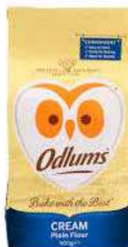
Odlums Cream Flour Weight/Quantity: 2kg Case: 2kg X 8pce Code: 60710