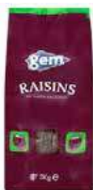
Gem Raisins Weight/Quantity: 3kg Case: 3kg X 4pce Code: 218