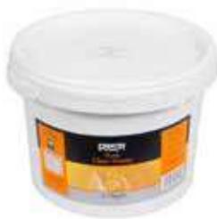
Honey Weight/Quantity: 3.17kg Case: 3.17kg X 1pce Code: 71658