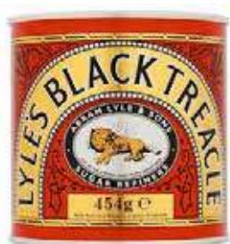
Lyle's Black Treacle Weight/Quantity: 454g Case: 454g X 12pce Code: 59145