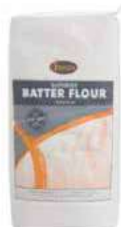
Smedes Superior Batter Flour Weight/Quantity: 12.5kg Case: 1 X 12.5kg Code: 2089