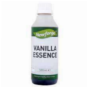
Newforge Vanilla Essence Weight/Quantity: 500ml Case: 500ml X 6pce Code: 75876