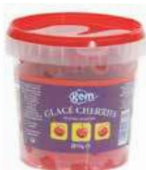
Gem Glace Cherries Weight/Quantity: 1kg Case: 1kg X 4pce Code: 74801