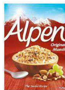
Alpen Original Weight/Quantity : 1.3kg Case: 1.3kg X 10pce Code: 58065