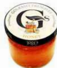
G'S Honey Glass Pots Weight/Quantity: 30g Case: 30g X 60pce Code: 1524