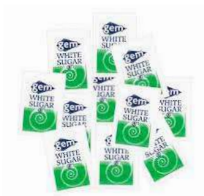
Gem Sugar Sachet Weight/Quantity: 2.5g Case: 2.5g X 1000pce Code: 74905