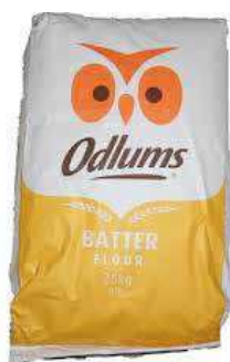
Odlums Batter Flour Weight/Quantity: 25kg Case: 25kg Code: 74563