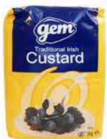
Gem Custard Powder Weight/Quantity: 3kg Case: 3kg X 4pce Code: 74087