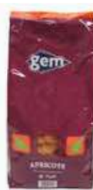
Gem Dried Apricots Weight/Quantity: 2kg Case: 2kg X 6pce Code: 74183