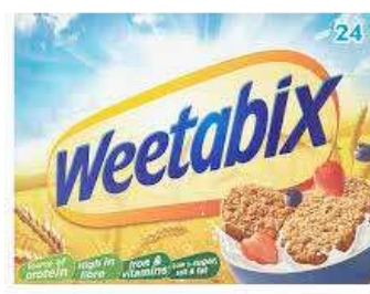
Nestle Weetabix Weight/Quantity: 24pce Case: 24pce X 12pce Code: 58082