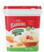
Flahavan's Porridge Oatlets Weight/Quantity: 4kg Case: 4kg Code: 1810