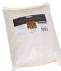
Milk Chocolate Drops Weight/Quantity: 2.5kg Case: 2.5kg X 4pce Code: 71633