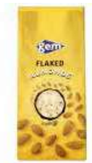
Gem Flaked Almonds Weight/Quantity: 1kg Case: 1kg X 10pce Code: 227