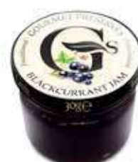
G'S Blackcurrant Jam Glass Pots Weight/Quantity: 30g Case: 30g X 60pce Code: 1522