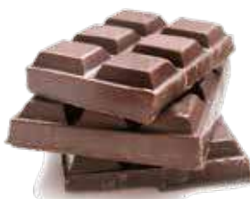
Richmond Milk Chocolate Block Weight/Quantity : 3kg Case: 3kg X 4pce Code: 74855