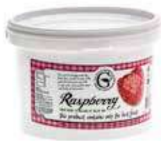
G'S Raspberry Jam Weight/Quantity: 3.5kg Case: 3.5kg Code: 1511