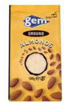
Gem Ground Almonds Weight/Quantity: 1kg Case: 1kg X 10pce Code: 225