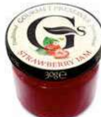
G'S Strawberry Jam Glass Pots Weight/Quantity: 30g Case: 30g X 60pce Code: 1520