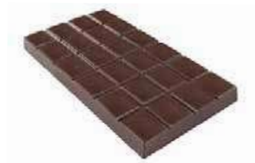
Richmond Dark Chocolate Block Weight/Quantity: 3kg Case: 3kg X 4pce Code: 74856