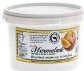
G'S Seville Marmalade Weight/Quantity: 3.5kg Case: 3.5kg Code: 1519