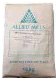
Self Raising Flour Weight/Quantity: 16kg Case: 16kg X 1pce Code: 191015