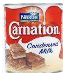
Carnation Condensed Milk Weight/Quantity: 397g Case: 397g X 24pce Code: 51202