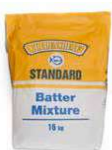
Golden Sheaf Batter Flour Weight/Quantity: 16kg Case: 16kg Code: 497