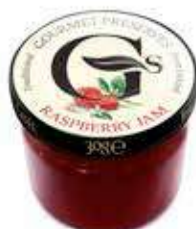
G'S Raspberry Jam Glass Pots Weight/Quantity: 30g Case: 30g X 60pce Code: 1521