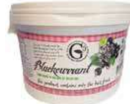
G'S Blackcurrant Jam Weight/Quantity: 3.5kg Case: 3.5kg Code: 1513