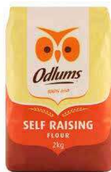
Odlums Self Raising Flour Weight/Quantity: 2kg Case: 2kg X 8pce Code: 60701