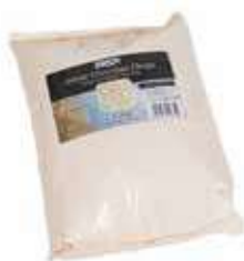
White Chocolate Drops Weight/Quantity: 2.5kg Case: 2.5kg X 4pce Code: 71634