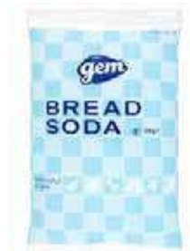
Gem Bread Soda Weight/Quantity: 3kg Case: 3kg X 4pce Code: 5481