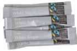
White Sugar Sticks Weight/Quantity: 2.5g Case: 2.5g X 1000pce Code: 70052