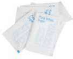
White Sugar Sachets Weight/Quantity: 2.5g Case: 2.5g X 1000pce Code: 70050