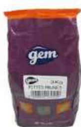
Gem Pitted Prunes Weight/Quantity : 3kg Case: 3kg X 4pce Code: 74824