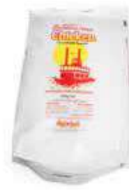
Southern Fried Chicken Breeding Weight/Quantity: 16kg Case: 16kg Code: 511