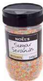
Noel's Sugar Strands Weight/Quantity: 540g Case: 540g X 6pce Code: 75884