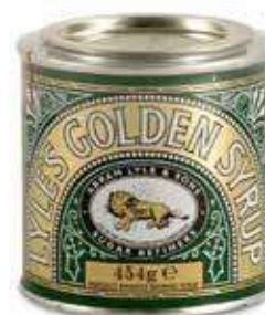
Lyle's Golden Syrup Weight/Quantity: 454g Case: 454g X 12pce Code: 59143