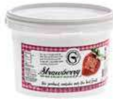
G'S Strawberry Jam Weight/Quantity: 3.5kg Case: 3.5kg Code: 1512