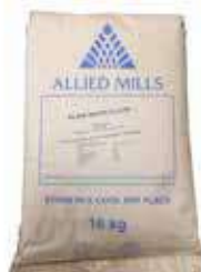
Plain Flour Weight/Quantity: 16kg Case: 16kg X 1pce Code: 191016