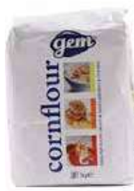
Gem Cornflour Weight/Quantity: 3kg Case: 3kg X 4pce Code: 74805