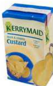
Kerrymaid Custard RTS Weight/Quantity: 1ltr Case: 1ltr X 12pce Code: 500011