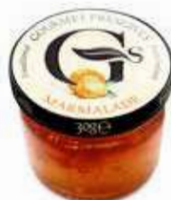
G'S Marmalade Glass Pot Weight/Quantity: 30g Case: 30g X 60pce Code: 1523