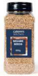
CK Sesame Seeds Weight/Quantity: 600g Case: 600g X 6pce Code: 972001