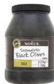
Noel's Pitted Black Olives Weight/Quantity: 2.37kg Case: 2.37kg X 2pce Code: 75871