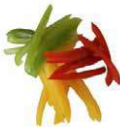
Sliced Mixed Peppers Weight/Quantity: 1 kg X 10 Case: 6kg Code: 8202