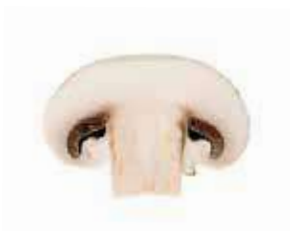
Sliced Mushrooms Weight/Quantity: 1.5kg X 4pce Case: 6kg Code: 4000