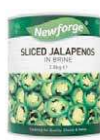
Sliced Jalapenos In Brine Weight/Quantity : 2.9kg Case: 2.9kg X 6pce Code: 15060