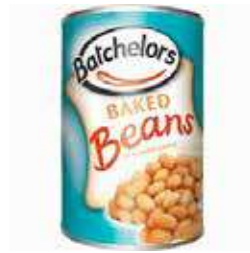
Batchelors Baked Beans Weight/Quantity: 420g Case: 420g X 24pce Code: 55802