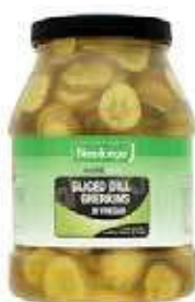
Newforge Sliced Dill Gherkins Weight/Quantity: 2.3kg Case: 2.3kg X 2pce Code: 798285