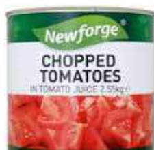
Newforge Chopped Tomatoes Weight/Quantity: 2.55kg Case: 2.55kg X 6pce Code: 75304