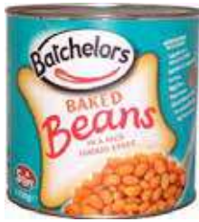
Batchelors Baked Beans Weight/Quantity: 2.61kg Case: 2.61kg X 6pce Code: 74732