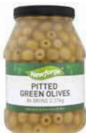
Newforge Pitted Green Olives Weight/Quantity: 2.38kg Case: 2.38kg X 1pce Code: 75873