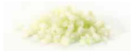
Diced Onions Weight/Quantity: 1kg X 10pce Case: 10kg Code: 375