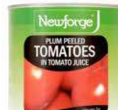
Newforge Plum Peeled Tomatoes Weight/Quantity: 2.55kg Case: 2.55kg X 6pce Code: 74653