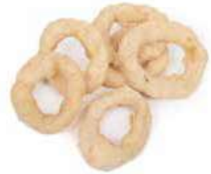
Digger's Preformed Onion Rings Weight/Quantity: 1kg X 6pce Case: 6kg Code: 12930