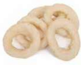
Digger's Natural Onion Rings Weight/Quantity: 1kg X 6pce Case: 6kg Code: 12920