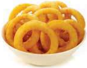
McCain Beer Battered Onion Rings Weight/Quantity: 1kg X 6pce Case: 6kg Code: 306501