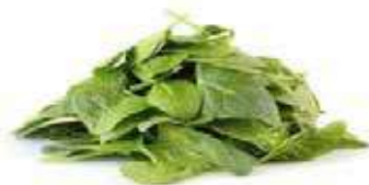
Baby Leaf Spinach Weight/Quantity: 2.5kg X 4pce Case: 10kg Code: 18286