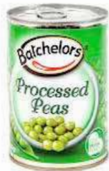
Batchelors Processed Peas Weight/Quantity: 420g Case: 420g X 24pce Code: 55752