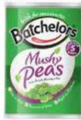
Batchelors Mushy Peas Weight/Quantity: 420g Case: 420g X 24pce Code: 55745