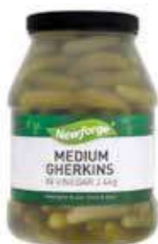
Newforge Medium Gherkins Weight/Quantity: 2.44kg Case: 2.44kg X 2pce Code: 74875