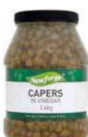
Newforge Capers Weight/Quantity: 2.44kg Case: 2.44kg X 2pce Code: 75234