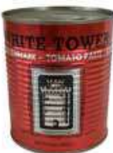
Tomato Puree Weight/Quantity: 1kg Case: 1kg X 12pce Code: 270377