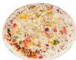
Fully Loaded Veggie Pizza