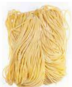
Smiling Cook Spaghetti Nest 50g Weight/Quantity: 5kg Case: 5kg X 1pce Code: 2515