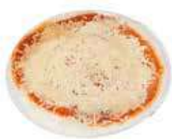
Fully Loaded Margherita Pizza