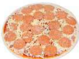
Fully Loaded Pepperoni Pizza