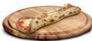
Big Al's Margherita Pizza Twist Weight/Quantity: 180g Case: 180g X 28pce Code: 958357