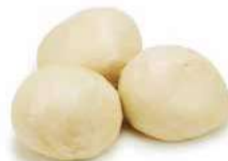
Pizza Doughballs Weight/Quantity : 280g Case: 280g X 35pce Code: 22830