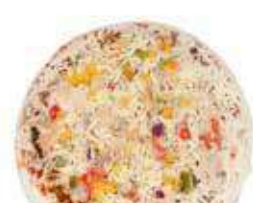
Fully Loaded Mad Mexican Pizza