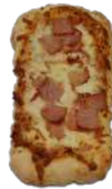
Ham & Cheese Handheld Pizza Weight/Quantity: 170g Case: 170g X 32pce Code: 22897