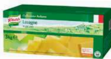
Knorr Lasagne Sheets Weight/Quantity: 3kg Case: 3kg X 1pce Code: 74953