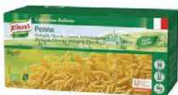
Knorr Penne Tubes Weight/Quantity: 3kg Case: 3kg X 1pce Code: 74958