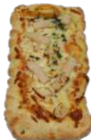
Chicken & Pesto Handheld Pizza Weight/Quantity: 170g Case: 170g X 32pce Code: 22896