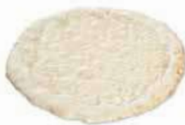
Ab Fab Plain Pizza Bases Weight/Quantity: 10" Case: 10" X 24pce Code: 95812