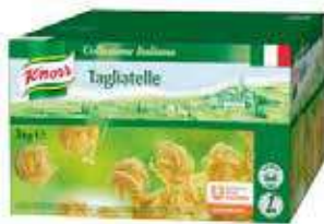
Knorr Tagliatelle Weight/Quantity: 3kg Case: 3kg X 1pce Code: 74948