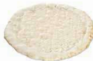
Ab Fab Pizza Base Weight/Quantity : 12" Case: 12" X 24pce Code: 95813