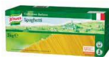
Knorr Spaghetti Weight/Quantity : 3kg Case: 3kg X 1pce Code: 74970