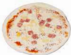
Fully Loaded Hawaiian Pizza