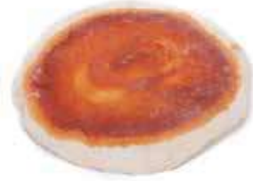
Ab Fab Pizza Base With Sauce Weight/Quantity : 12" Case: 12" X 24pce Code: 206