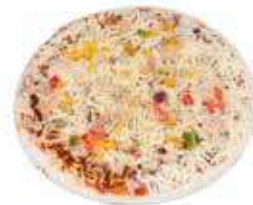
Fully Loaded Dream Team Pizza