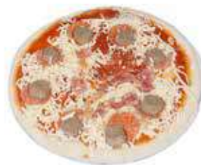
Fully Loaded Mighty Meaty Pizza