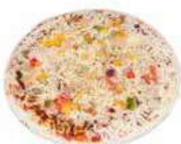
Fully Loaded Porky The Pig Pizza