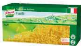
Knorr Fusilli Spirals Weight/Quantity: 3kg Case: 3kg X 1pce Code: 74959