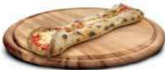
Big Al's Pepperoni Pizza Twist Weight/Quantity: 180g Case: 180g X 28pce Code: 958358