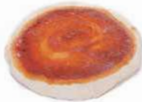
Ab Fab Pizza Bases With Sauce Weight/Quantity: 9" Case: 9" X 48pce Code: 02125