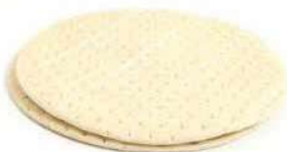
Ab Fab Gluten Free Pizza Base Weight/Quantity: 12" Case: 12" X 24pce Code: 71235