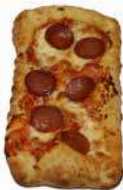
Mediterranean Pepperoni Handheld Pizza Weight/Quantity: 170g Case: 170g X 32pce Code: 22898