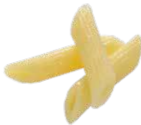
Smiling Cook Penne Pasta Weight/Quantity: 2.5kg Case: 2.5kg X 4pce Code: 2520