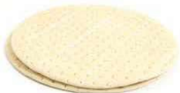
Ab Fab Gluten Free Pizza Bases Weight/Quantity: 10" Case: 10" X 24pce Code: 12345