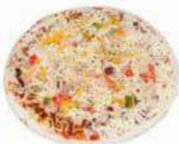
Fully Loaded BBQ Chicken Pizza