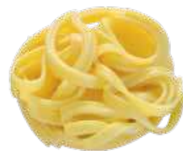
Smiling Cook Tagliatelli Nest 50g Weight/Quantity: 5kg Case: 5kg X 1pce Code: 2514