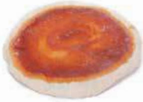
Ab Fab Pizza Bases With Sauce Weight/Quantity: 7" Case: 7" X 24pce Code: 302