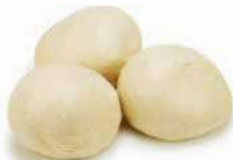
Pizza Doughballs Weight/Quantity: 185g Case: 185g X 78pce Code: 64400