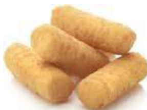
Lutosa Potato Croquettes Weight/Quantity: 2.5kg X 4pce Case: 10kg Code: 3335