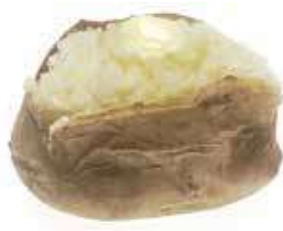
Jacket Potato Weight/Quantity: 280/340g Case: 18pce Code: 1000002593