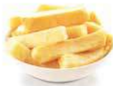
Golden Fry 14mm Chilled Chips Weight/Quantity: 5kg X 2pce Case: 10kg Code: 1032812