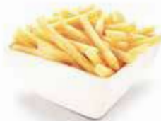
McCain Freeze Chill 6mm Chips Weight/Quantity: 2.5kg X 5pce Case: 12.5kg Code: 95004