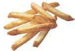
McCain Skin On Country Style Fries Weight/Quantity : 2.5kg X 5pce Case: 12.5kg Code: 1999