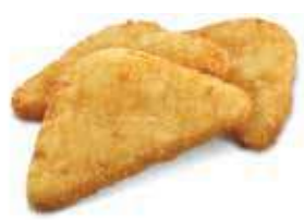
Pierre's Hash Browns Weight/Quantity : 2.5kg X 4pce Case: 10kg Code: 3334