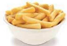
McCain Freeze Chill 11mm Chips Weight/Quantity: 2.5kg X 5pce Case: 12.5kg Code: 95002