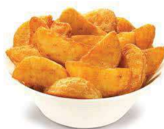
Lutosa Spicy Potato Wedges Weight/Quantity: 2.5kg X 4pce Case: 10kg Code: 170400