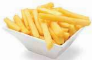
McCain Freeze Chill 9mm Chips Weight/Quantity: 2.5kg X 5pce Case: 12.5kg Code: 95003