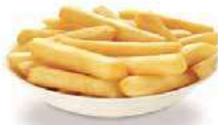
McCain Freeze Chill 14mm Chips Weight/Quantity: 2.5kg X 5pce Case: 12.5kg Code: 95001