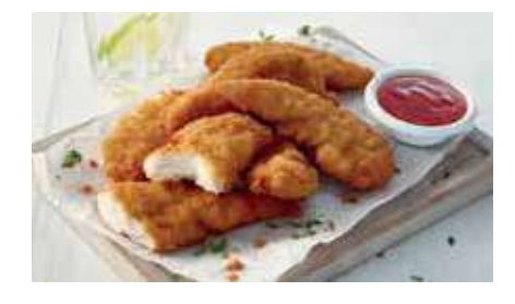
Glenhaven Breaded Tenders Weight/Quantity: 1kg x 5 Case: Code: 25000