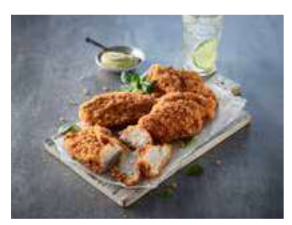
Glenhaven Southern Fried FilletWeight/Quantity : 155gCase:1.25kg x 4Code:25008