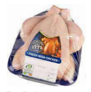
1600g Tray Pack Weight/Quantity: 1600g Case: 1600g X 5pce Code: 37