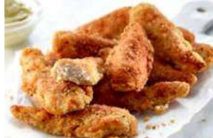
Glenhaven Southern Fried GoujonWeight/Quantity:2.5kgCase:2.5kg x 2Code:2255

Glenhaven Plain GoujonWeight/Quantity:2.5kgCase:2.5kg x 2Code:25055