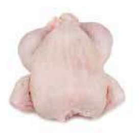
1600g Loose Chicken Weight/Quantity: 1600g 1600g X 8pce Case: Code: 8136