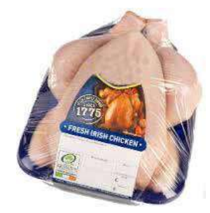
1200g Tray Pack Weight/Quantity: 1200g Case: Code: 134