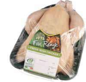
1300g Free Range Tray Pack Weight/Quantity: 1300g 1300g X 6pce Code: 123