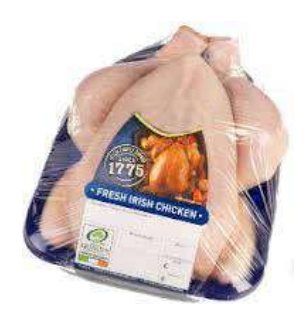
1400g Tray Pack Approx Weight: 1400g Case: 1400g X 6pce Code: 135