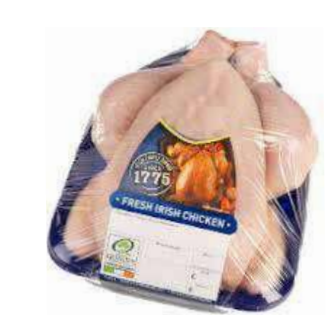
1700g Tray Pack Weight/Quantity: 1700g Case: 1700g X 5pce Code: 39