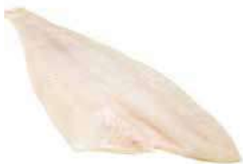
Plaice Fillets 280/340g Approx Weight: 4.54kg Case: 15 Pce Approx Code: 76017