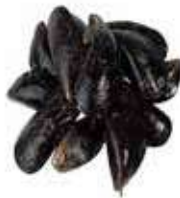
Whole Shell Mussels Approx Weight: 5kg Case: 5kg Code: 76048