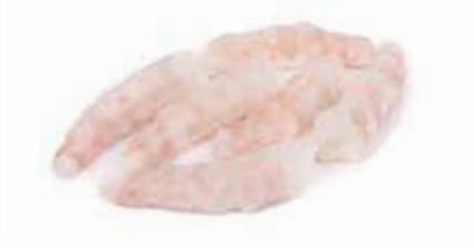
Argentinian Red Prawns 70/90 Weight/Quantity: 1kg Case: 1kg X 10 Code: 7908