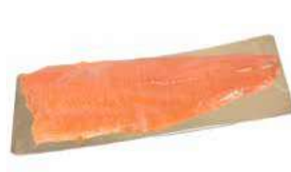
Smoked Salmon Sliced Approx Weight: 1kg Approx Case: 1kg Approx Code: 75010