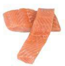
Salmon Portions Weight/Quantity: 170g Case: 170g X 10 Code: 760191