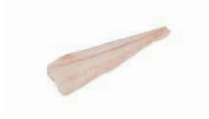
Clear Ice Cod Fillet 280/340g Approx Weight: 5kg Case: 15 Pce Approx Code: 76012