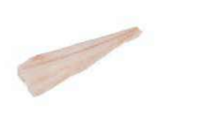
Pacific Cod Fillet 200/280g Approx Weight: 4.54kg Case: 18 Pce Approx Code: 18014