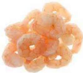
Cooked & Peeled Prawns 90/125 Approx Weight: 2kg Case: 2kg x 5 Code: 76042