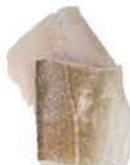
Hake Fillets 255g Approx Weight: 9kg Case: 35 Pce Approx Code: 65489