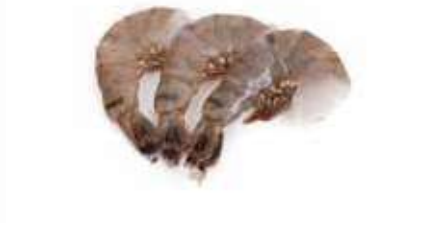
Prawns 16/20 Raw, Peeled & Devined Weight/Quantity: 1kg Case: 1kg X 10 Code: 76038