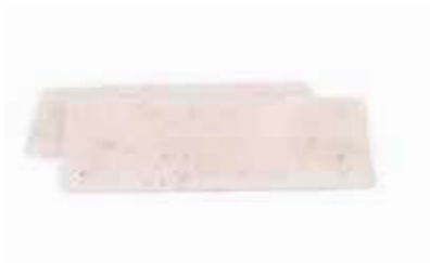
Nolans Cod Portions 100g Approx Weight: 5kg Case: 50 Pce Approx Code: 76030