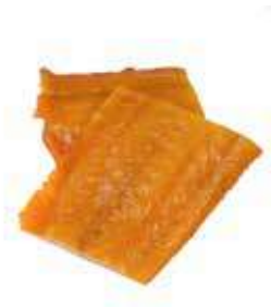
Smoked Coley Fillets 340g Approx Weight: 6.35kg Case: 19 Pce Approx Code: 25813