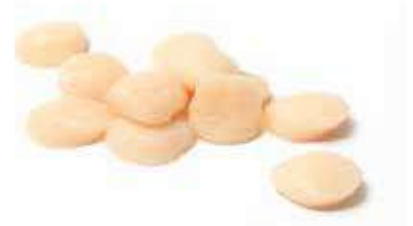
King Scallop Roe Off Approx Weight: 1kg Case: 1kg X 10 Code: 76044