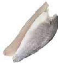
Seabass Fillets 90/110g Approx Weight: 5kg Case: 50 Pce Approx Code: 760271