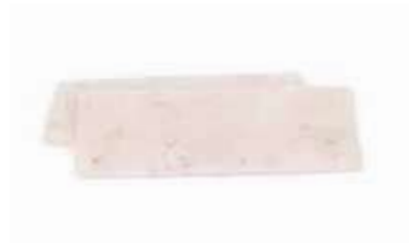
Nolans Cod Portions 85g Approx Weight: 5.1kg Case: 60 Pce Approx Code: 76029