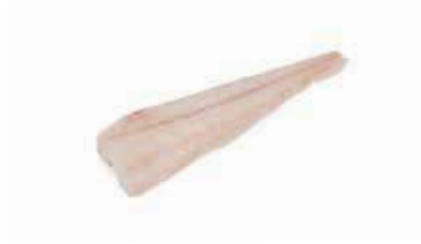
Pacific Cod Fillet 200/225g Approx Weight: 4.54kg Case: 22 Pce Approx Code: 10082