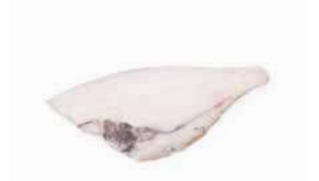
Plaice Fillet Skin On 170/220g Approx Weight: 4.54kg Case: 24 Pce Approx Code: 40005