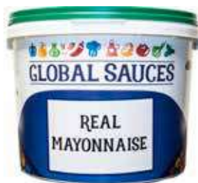
Global Sauces Real Mayo Weight/Quantity: 10ltr Case: 10ltr X 1pce Code: 111001