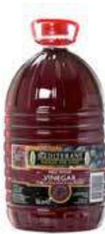
Red Wine Vinegar Weight/Quantity: 2ltr Case: 2ltr X 6pce Code: 10180