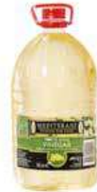
White Wine Vinegar Weight/Quantity: 2ltr Case: 2ltr X 6pce Code: 10170