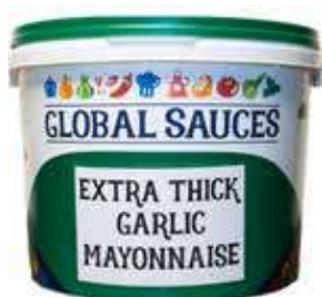
Global Sauces Thick Garlic Mayo Weight/Quantity: 10ltr Case: 10ltr X 1pce Code: 111003