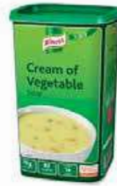
Knorr Cream Of Vegetable Soup

Weight/Quantity: 14ltr Case: 14ltr X 3pce Code: 70325