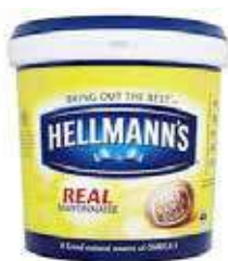
Hellmann's Real Mayonnaise Weight/Quantity: 10kg Case: 10kg X 1pce Code: 74459