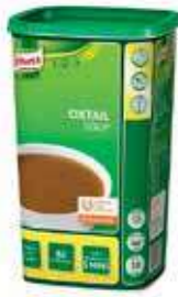
Knorr Oxtail Soup

Weight/Quantity: 14ltr Case: 14ltr X 3pce Code: 70328