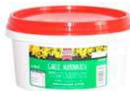
Alfees Garlic Mayonnaise Weight/Quantity: 10kg Case: 10kg X 1pce Code: 7078