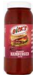
Bicks Hamburger Relish Weight/Quantity: 2.45kg Case: 2.45kg X 4pce Code: 78123