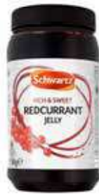
Schwartz Redcurrant Jelly Weight/Quantity: 1.5kg Case: 1.5kg X 6pce Code: 75207