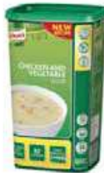
Knorr Chicken & Vegetable Soup

Weight/Quantity: 14ltr Case: 14ltr X 3pce Code: 70327