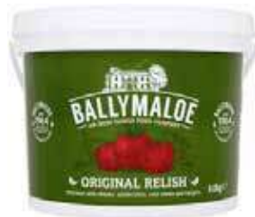
Ballymaloe Original Relish Weight/Quantity: 5kg Case: 5kg X 1pce Code: 73523