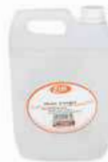
Erin White Vinegar Weight/Quantity: 5ltr Case: 5ltr X 4pce Code: 74520