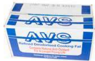
AVS Cooking Fat Weight/Quantity: 12.5kg Case: 12.5kg X 1pce Code: 177046