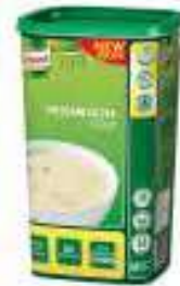
Knorr Mushroom Soup

Weight/Quantity : 14ltr Case: 14ltr X 3pce Code: 70334