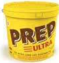
Prep Ultra Oil Weight/Quantity: 15ltr Case: 15ltr X 1pce Code: 177044