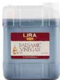
Balsamic Vinegar Weight/Quantity: 2ltr Case: 2ltr X 6pce Code: 10020