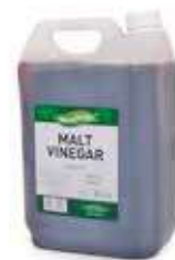
Newforge Malt Vinegar Weight/Quantity: 5ltr Case: 5ltr X 2pce Code: 431650