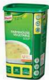
Knorr Farmhouse Vegetable Soup

Weight/Quantity: 14ltr Case: 14ltr X 3pce Code: 70335