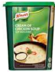
Knorr Cream Of Chicken Soup

Weight/Quantity: 14ltr Case: 14ltr X 3pce Code: 70328