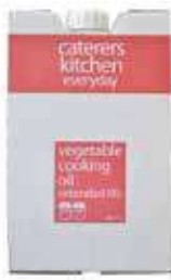
Caterers Kitchen Vegetable Oil Weight/Quantity: 20ltr Case: 20ltr X 1pce Code: 1261