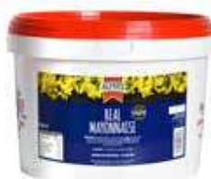
Alfees Real Mayonnaise Weight/Quantity: 10kg Case: 10kg X 1pce Code: 1301