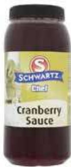
Schwartz Cranberry Sauce Weight/Quantity: 2.65kg Case: 2.65kg X 4pce Code: 75773