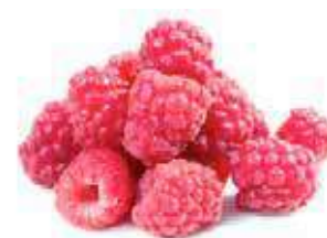
Frozen Raspberries Weight/Quantity: 500g Case: 500g X 20pce Code: 4402