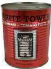
Tomato Puree Weight/Quantity: 1kg Case: 1kg X 12pce Code: 270377