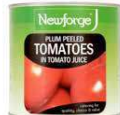
Newforge Plum Peeled Tomatoes Weight/Quantity: 2.55kg Case: 2.55kg X 6pce Code: 74653