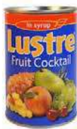
Lustre Fruit Cocktail Weight/Quantity: 2.5kg Case: 2.5kg X 6pce Code: 54622