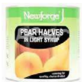
Newforge Pear Halves Weight/Quantity: 2.6kg Case: 2.6kg X 6pce Code: 75817