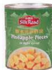
Pineapple Chunks Weight/Quantity: 850g Case: 850g X 24pce Code: 381