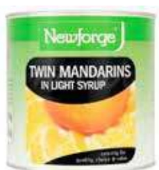
Newforge Mandarins Weight/Quantity: 2.65g Case: 2.65kg X 6pce Code: 75761