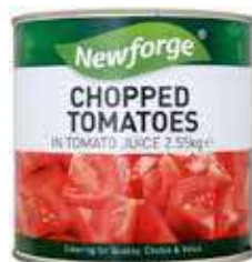
Newforge Chopped Tomatoes Weight/Quantity: 2.55kg Case: 2.55kg X 6pce Code: 75304