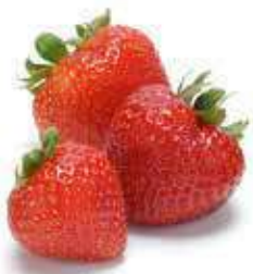
Frozen Strawberries Weight/Quantity: 1kg Case: 1kg X 5pce Code: 4401