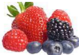
Mixed Forrest Fruits Weight/Quantity: 15x450g Code: 4411