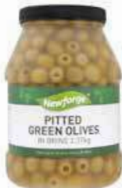
Newforge Pitted Green Olives Weight/Quantity: 2.38kg Case: 2.38kg X 1pce Code: 75873