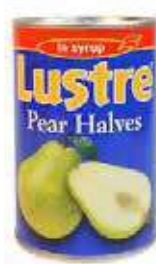
Lustre Pear Halves Weight/Quantity: 2.6kg Case: 2.6kg X 6pce Code: 75817