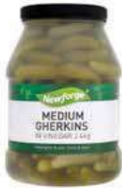
Newforge Medium Gherkins Weight/Quantity: 2.44kg Case: 2.44kg X 2pce Code: 74875