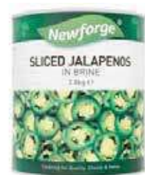
Sliced Jalapenos In Brine Weight/Quantity : 2.9kg Case: 2.9kg X 6pce Code: 15060