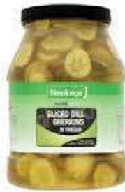
Newforge Sliced Dill Gherkins Weight/Quantity: 2.3kg Case: 2.3kg X 2pce Code: 798285