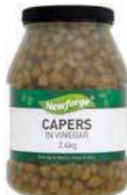
Newforge Capers Weight/Quantity: 2.44kg Case: 2.44kg X 2pce Code: 75234