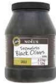
Noel's Pitted Black Olives Weight/Quantity: 2.37kg Case: 2.37kg X 2pce Code: 75871