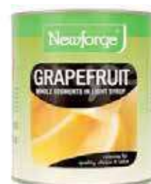
Newforge Grapefruit Segments Weight/Quantity : 1.25kg Case: 1.25kg X 12pce Code: 75816