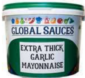
Global Sauces Thick Garlic Mayo Weight/Quantity: 10ltr Case: 10ltr X 1pce Code: 111003