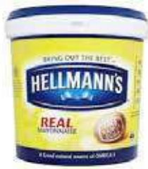
Hellmann's Real Mayonnaise Weight/Quantity: 10kg Case: 10kg X 1pce Code: 74459