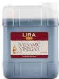
Balsamic Vinegar Weight/Quantity: 2ltr Case: 2ltr X 6pce Code: 10020