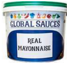
Global Sauces Real Mayo Weight/Quantity: 10ltr Case: 10ltr X 1pce Code: 111001