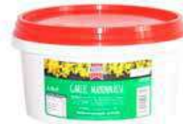
Alfees Garlic Mayonnaise Weight/Quantity: 10kg Case: 10kg X 1pce Code: 7078