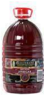
Red Wine Vinegar Weight/Quantity: 2ltr Case: 2ltr X 6pce Code: 10180