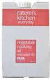
Caterers Kitchen Vegetable Oil Weight/Quantity: 20ltr Case: 20ltr X 1pce Code: 1261