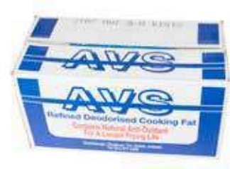
AVS Cooking Fat Weight/Quantity: 12.5kg Case: 12.5kg X 1pce Code: 177046