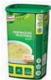
Knorr Farmhouse Vegetable Soup Weight/Quantity: 14ltr Case: 14ltr X 3pce Code: 70327