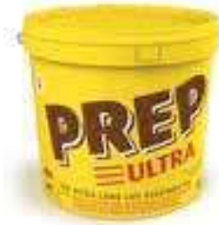
Prep Ultra Oil Weight/Quantity: 15ltr Case: 15ltr X 1pce Code: 177044