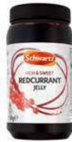
Schwartz Redcurrant Jelly Weight/Quantity: 1.5kg Case: 1.5kg X 6pce Code: 75207