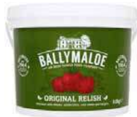
Ballymaloe Original Relish Weight/Quantity: 5kg Case: 5kg X 1pce Code: 73523