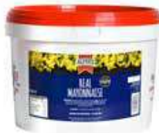
Alfees Real Mayonnaise Weight/Quantity: 10kg Case: 10kg X 1pce Code: 1301