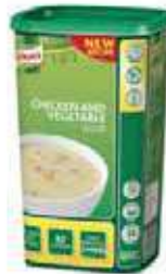
Knorr Chicken & Vegetable Soup Weight/Quantity : 14ltr Case: 14ltr X 3pce Code: 70334