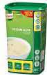
Knorr Mushroom Soup Weight/Quantity: 14ltr Case: 14ltr X 3pce Code: 70329