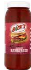
Bicks Hamburger Relish Weight/Quantity: 2.45kg Case: 2.45kg X 4pce Code: 78123