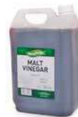
Newforge Malt Vinegar Weight/Quantity: 5ltr Case: 5ltr X 2pce Code: 431650